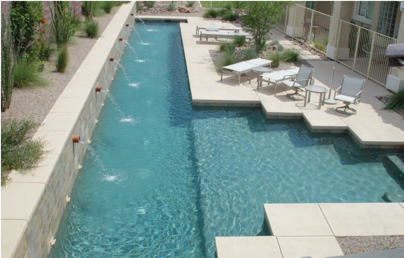
Stretching out along the deck, the 70 feet of this lap pool are finished with a steel gray aggregate interior. Red clay flumes set in a 3-ft. high retaining wall accent the poolscape's clean beauty.