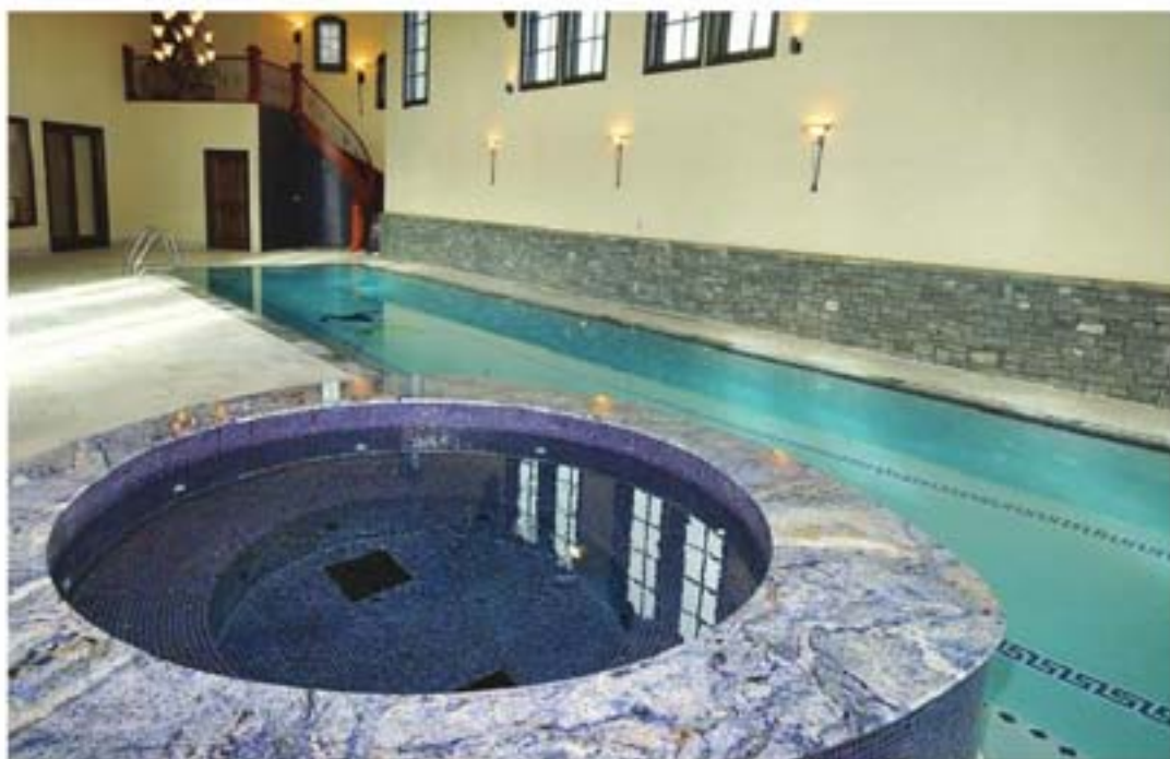
Given Calgary's often harsh climate, indoor pools have become more popular, even among the company's residential clients.