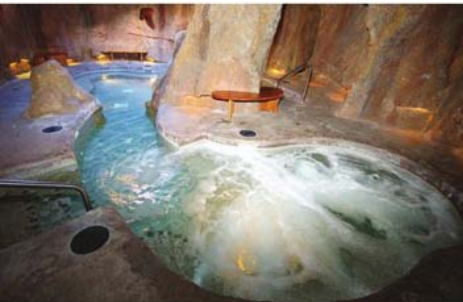
The residential indoor pool market has continued to increase over the last five years, a trend the company is looking to capitalize on.

indoors," he explains. "The enclosures that house the pools are generally of the same quality as the home construction, with complete dehumidification systems, and are suitable for year-round enjoyment."