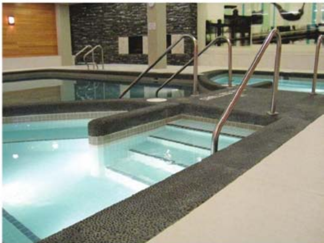
Hotel and condominium pools comprise a large portion of Master Pools' client base.

"There are a significant number of high-end residential pools and spas in the Calgary area that are constructed