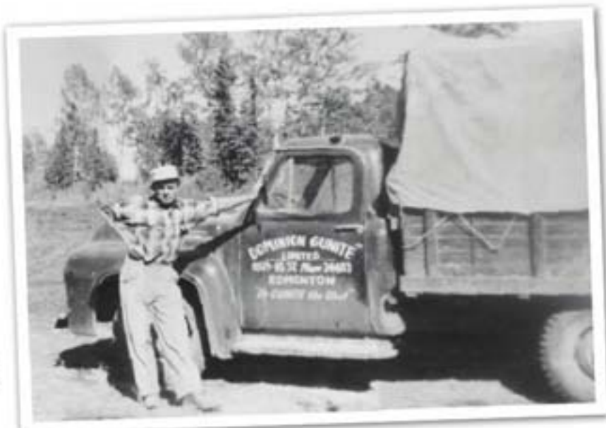
When the company was originally founded in 1955, it specialized in shotcrete (gunite) for tunnels and retaining walls.