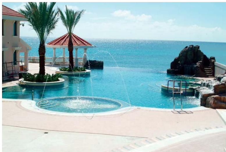
The client wanted a curved, shaped pool that would be a ‘one-of-a-kind water experience’ where people could have fun and enjoy themselves.

After two years, at a cost of $2 million US (excluding the cost for decking and landscaping, which was completed by other companies) the project was completed and the client was left with a remarkable man-made element that superbly reflects the island’s natural beauty. PSM