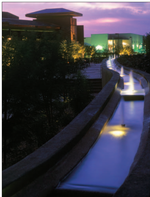
Sacred submersion: Five elevated copper scuppers (above) fall into this striking Phoenix baptistery (far left), which is used by the pastors for monthly baptisms. Meanwhile, a hydraulically perfected runnel (left) transports water from the pool through the church's courtyard.