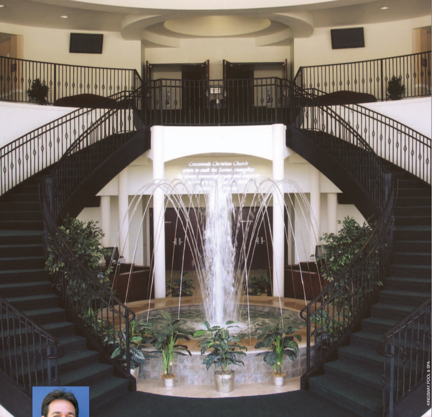
KINGSWAY POOL & SPA