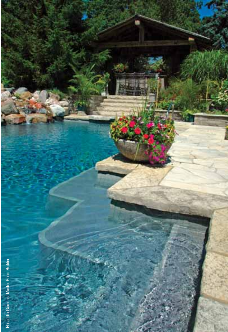
Hollandia Gardens, Master Pools Builder