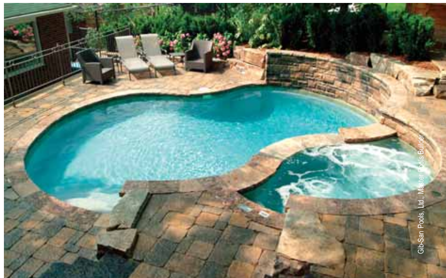
Gib-San Pools, Ltd., Master Pools Builder

Having three or four contracting companies – pool, decking, landscaping – all working independently, with each adding its own interpretation and creative style – or not – is generally not the best approach to creating a winning backyard design. It makes sense that an integrated master plan done up-front with your lifestyle in mind will produce better results – something exceptional.