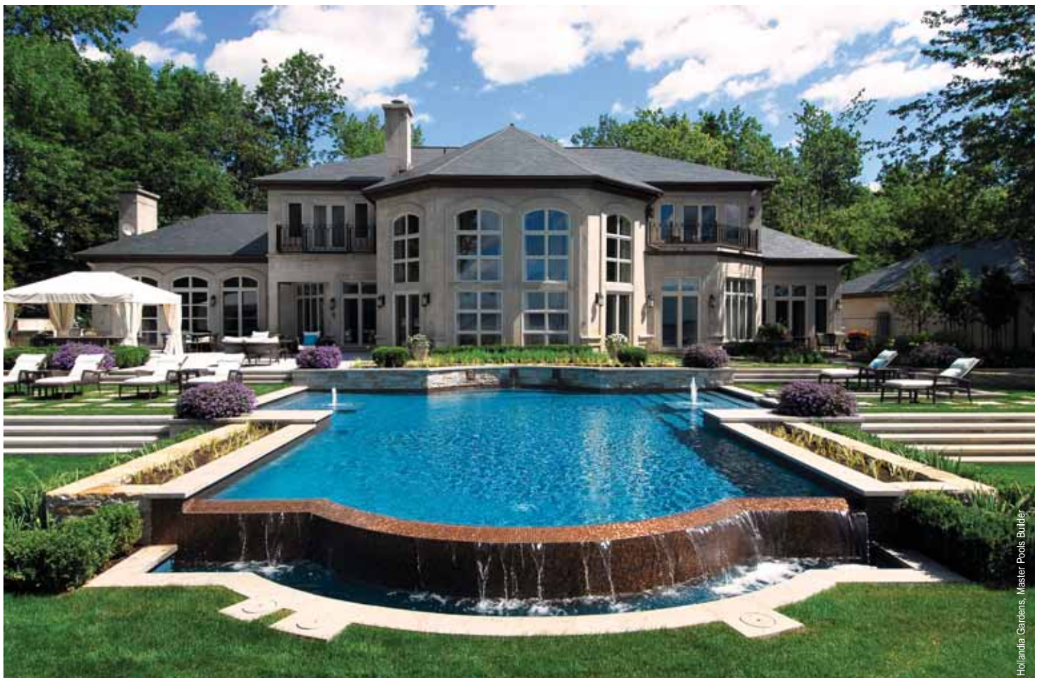
Hollandia Gardens, Master Pools Builder

Water features add an exciting focal point to your backyard. Imagine the added intrigue of viewing your wooded ravine or a distant body of water across a vanishing pool edge where one becomes the extension of the other. How about a waterfall –