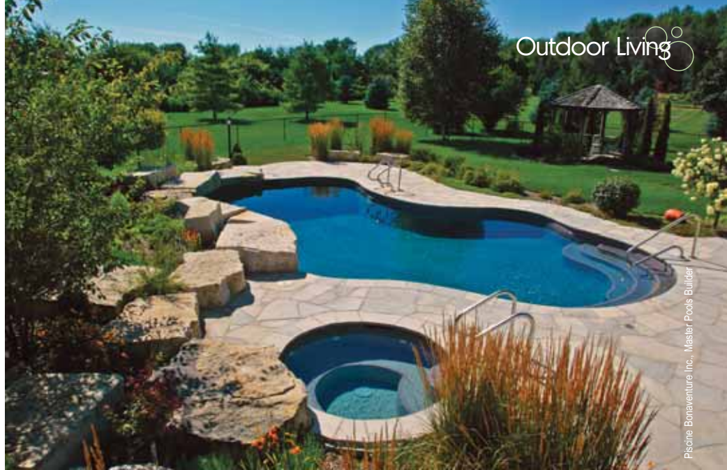
Piscine Bonaventure Inc., Master Pools Builder

Today's outdoor entertainment systems surpass what you have inside. Why not watch your favourite team on a plasma television camouflaged into the landscape while sitting in your spa or pool? Listen to music while doing laps with bass from the underwater speakers helping you keep pace.